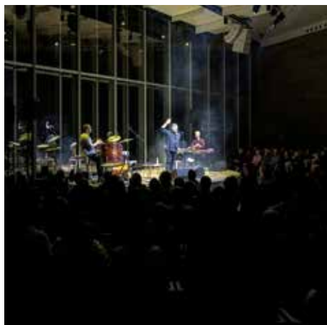
Concert by the cantautor of flamenco Perrate