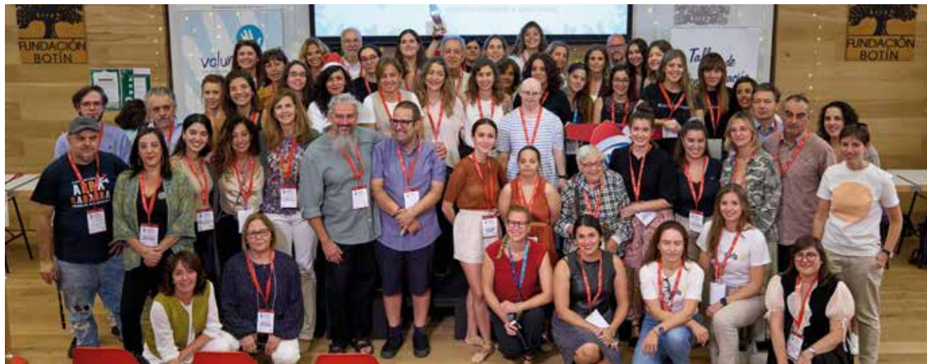
Corporate-NGO volunteering point