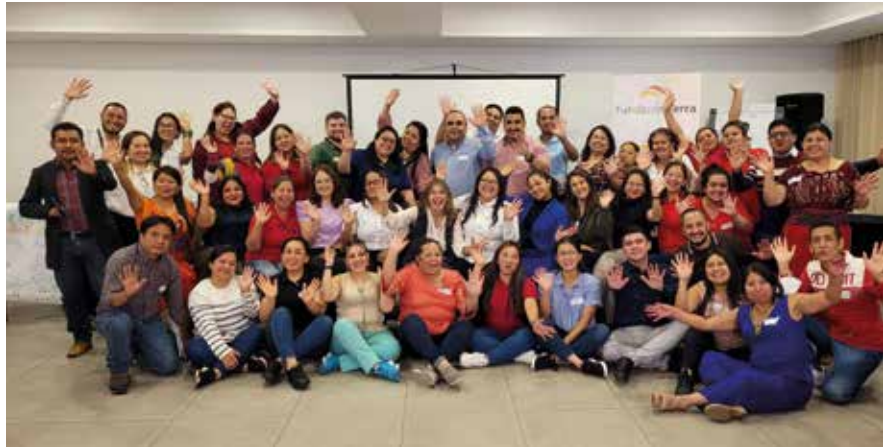
Initial Training in Guatemala with the new Terra Foundation centres