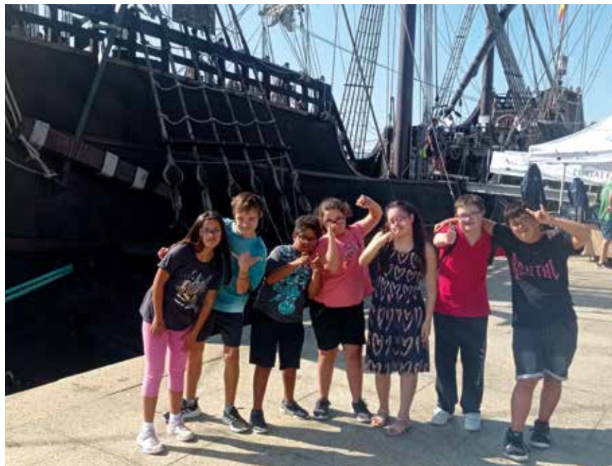
Activities of Fundación Síndrome de Down de Cantabria

In the final week of the programme, a Networking Day was held at Fundação Getúlio Vargas in Rio de Janeiro, a training and collaborative work meeting between the students of the 14th edition, representatives of the regional networks and several alumni who are driving the network’s projects. In addition, this year’s event included a very special space for all members, as the dates of the next in-person meeting of the Public Servants Alumni Network, to be held in 2024 in Cartagena de Indias, were announced.