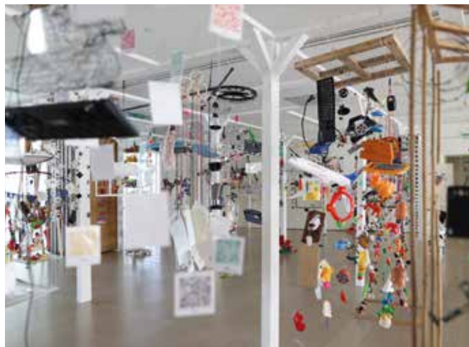
Reflejarte Exhibition in Cantabria