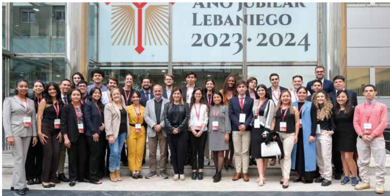
María José Sáenz de Buruaga Gómez, President of Cantabria, welcomes the participants in the 14 th edition of the programme Fortalecimiento de la Función Pública en América Latina