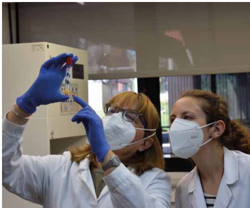
Researchers in the laboratory of the company EpiDisease