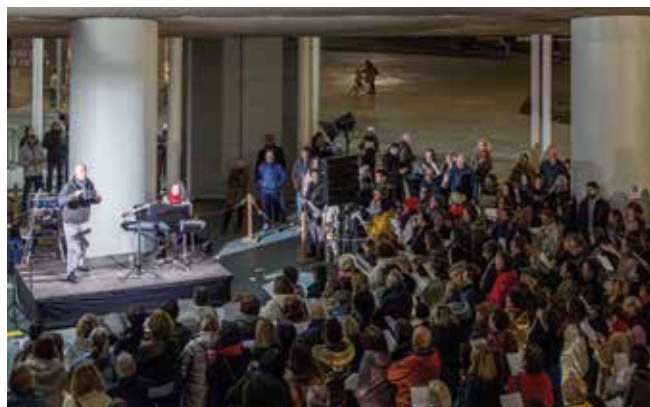
Final performance of the ephemeral Christmas choir