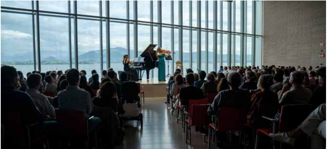
Asociación Mujer y Talento concert at Centro Botín