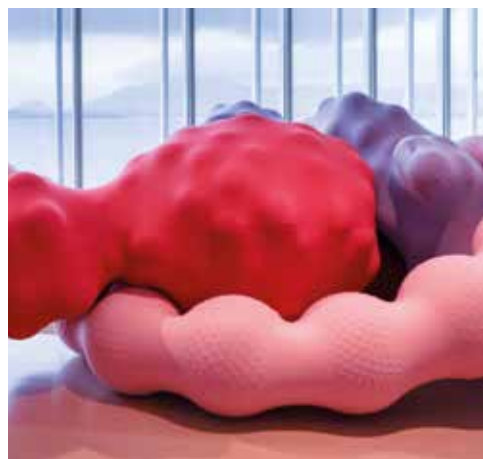
View of the exhibition "Enredos: Eva Fàbregas"