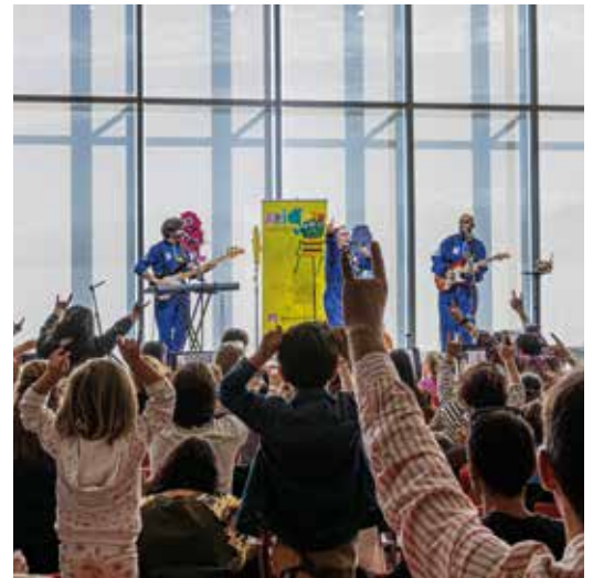
Family concert with "Arigato. Cuento que te canto"

created his "constructed scene" (with dancers, choreographers and singers from his own team, who travelled to Santander for four months, some of them with their children, as well as with local non-professional performers and their families) through something as universal as the family, starting from the birth of Jesus of Nazareth, through the 16 th century in Toledo to the present day in Santander.