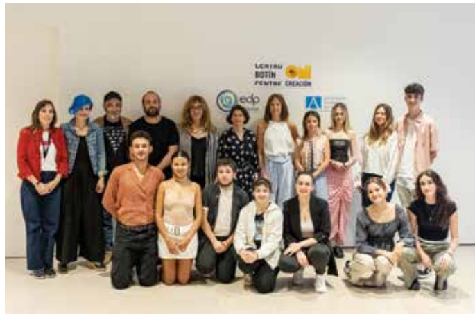
Participants selected for the 1 st edition of On Creación