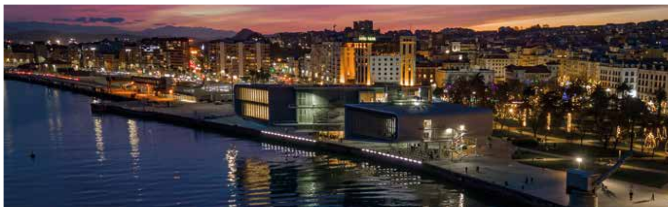
Aerial view of Centro Botín

and creative development. In 2023, we presented the exhibition Somos Creativos XVII: El infinito de lo cotidiano , inspired by the exhibition Damián Ortega: Visión Expandida , which was visited by more than 3,700 people.