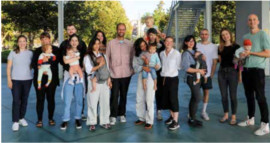
Families taking part in Tino Sehgal's live performance of "This youiiyou (Este túyoyotú)"