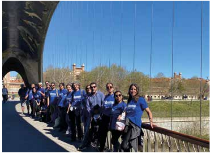
Manzanares 30 km walkers on the Cáscara del Matadero bridge (Madrid)

Since its creation in 2008, this think tank focuses on analysing the governance and comprehensive management of water. With the aim of contributing to sustainable water management, the Water Observatory works to generate relevant knowledge for water resources management. It serves as a platform for dialogue and training for professionals in the sector and promotes the involvement of society in this improvement.