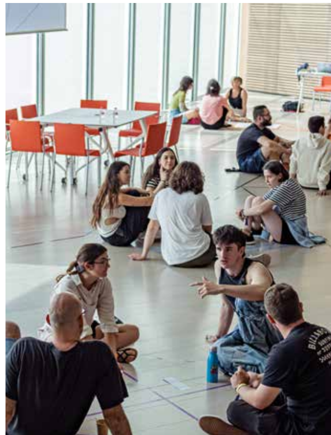
1 st edition of Festival ON, organised in collaboration with the University of Cantabria