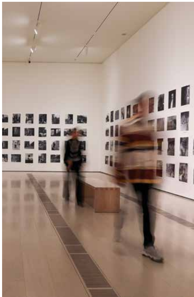
View of the exhibition "Itinerarios XXVIII"