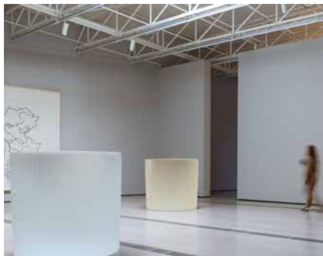
View of the exhibition "Roni Horn: Me paraliza la esperanza"