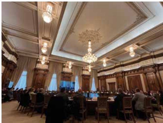
OECD education meeting