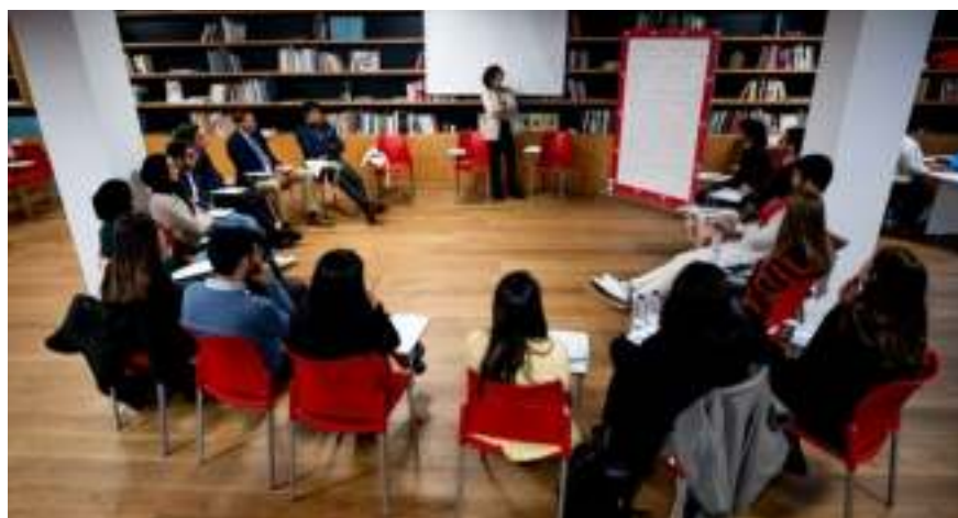
More than 250 young people have received individual or group mentoring services from the Princesa de Girona Foundation