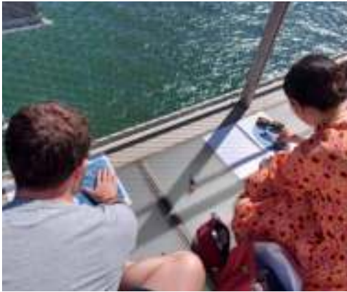
The creative participatory action "Path of Cyanotypes"