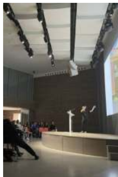
A “Types” talk in the Centro Botín

Other contributions went to the Ateneo de Santander, a now long-standing collaboration for the development of cultural activities; to the Fundación Empieza por Educar, and to the Asociación Plaza Porticada. The Fundación Renzo Piano and the Santander International Festival also received support from the Fundación Botín in 2022, thereby contributing to the development of their activities.