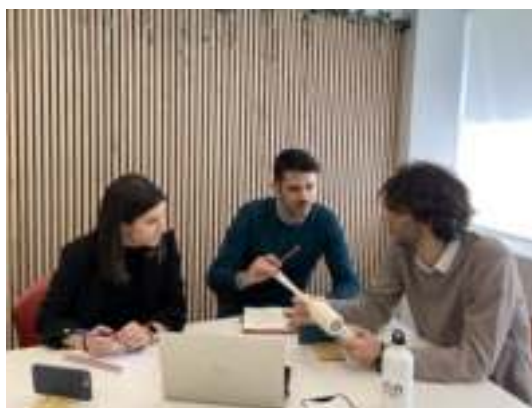
Innitius company team