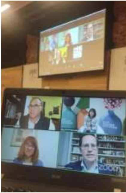
RE talk "Preventing Suicide in Adolescence"

1,800 teachers from different countries who are concerned about this issue. In parallel, the RE Connect programme of encounters within specific types of educational centre organized "Building bridges between special education and inclusive education" for special education centres, on the one hand, and "360° tour of the profiles of rural centres" for rural schools, on the other, with the participation of autonomous communities such as Galicia, Murcia, Aragón, Castilla y León, Cantabria and Madrid.