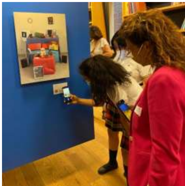
Inauguration of the exhibition We Are Creative 16 in our Madrid headquarters