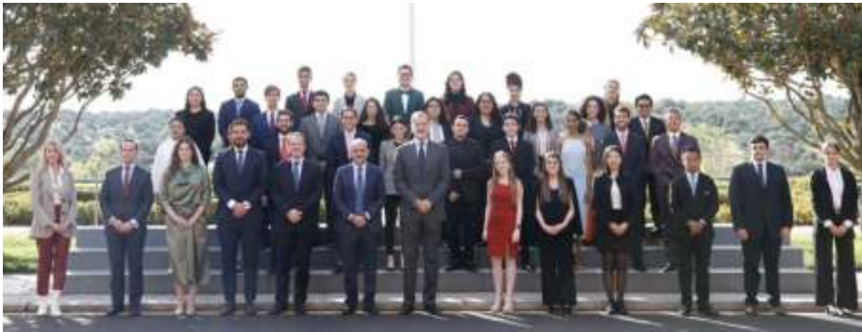
His Majesty King Felipe VI received the participants of the 13 th Programme for Strengthening the Civil Service in Latin America in the Zarzuela Palace