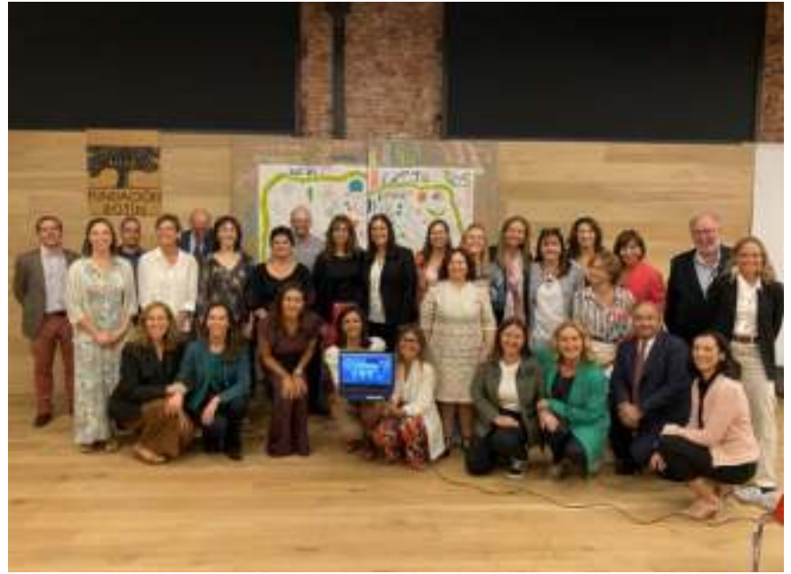
Close of the 2 nd iteration of the Specialist Programme in Emotional and Social Education and Creativity for Educational Transformation

Now in its seventh iteration, the series of talks entitled "The Education We Want" continued to address the key issues in educational theory and practice in its seventh iteration, and in 2022 the protagonists were the students themselves, who had the op-