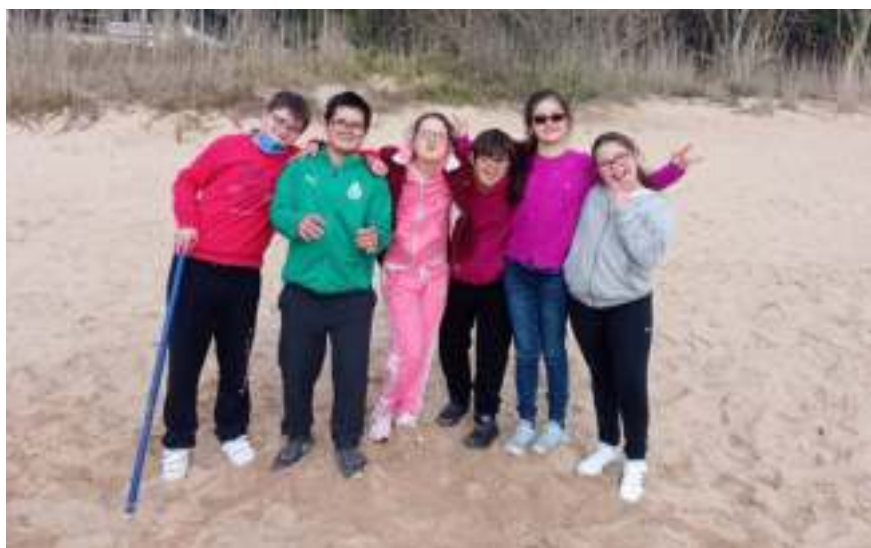
An activity of the Fundación Síndrome de Down

During the 13th iteration of the programme, the Network continued to be closely involved, with graduates from different iterations, professions and countries giving in-person and online sessions to the students, thus demonstrating the value of support and the richness of a Network as heterogeneous as it is committed to the principles that animate it. The presentations made dealt with “Innovation in Public Service”, “Good governance and transparency”, “Sustainability and education”, “The role of technology in the public sphere” “Implementation of economic public policies in Brazil”, “The work of the OAS in the Americas”, “Political communication” and “The current situation in the region”. In the last week of the programme, a special Network Day was held at the Fundação Getulio Vargas, a training and work meeting between the students of the 13th iteration with the representatives of the Regional Networks and the Alumni.