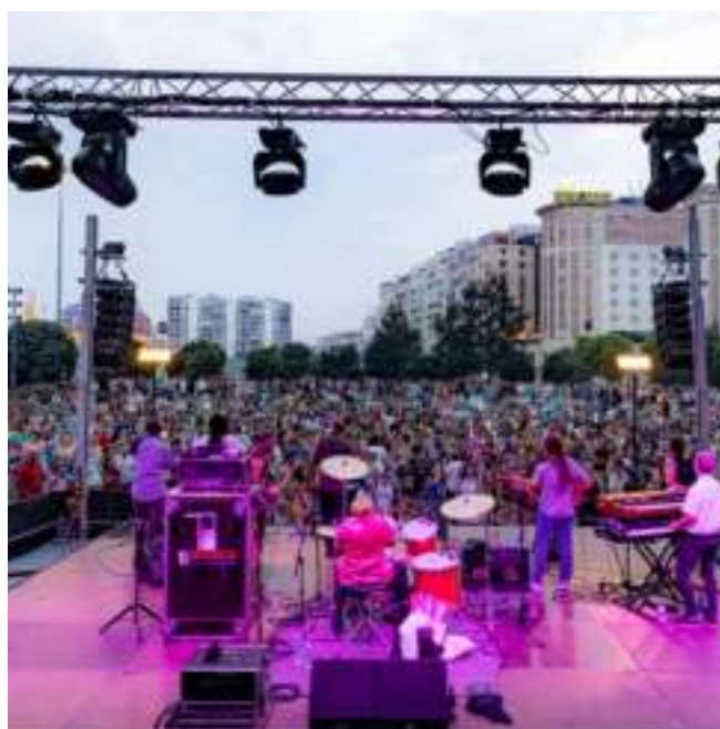
Concert by The Skatalytes in the Centro Botín auditorium