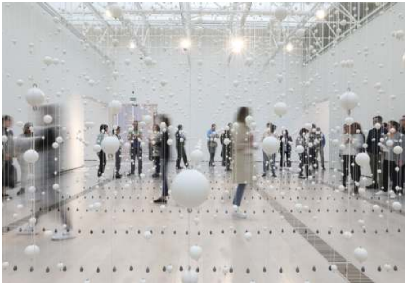
A view of the exhibition Damián Ortega: Expanded Vision

Weil, the show offered an overview of two decades of the artist's work in a variety of media, including film installations produced in recent years in partnership with the Dutch artist Edgar Cleijne. After this, Damián Ortega: Expanded Vision , curated by Vicente Todolí, grouped together for the first time the artist's suspended pieces. The exhibition proposal and the activities programmed around the exhibition have been very well received, fostering in visitors a new and transcendent way of looking at ordinary objects.