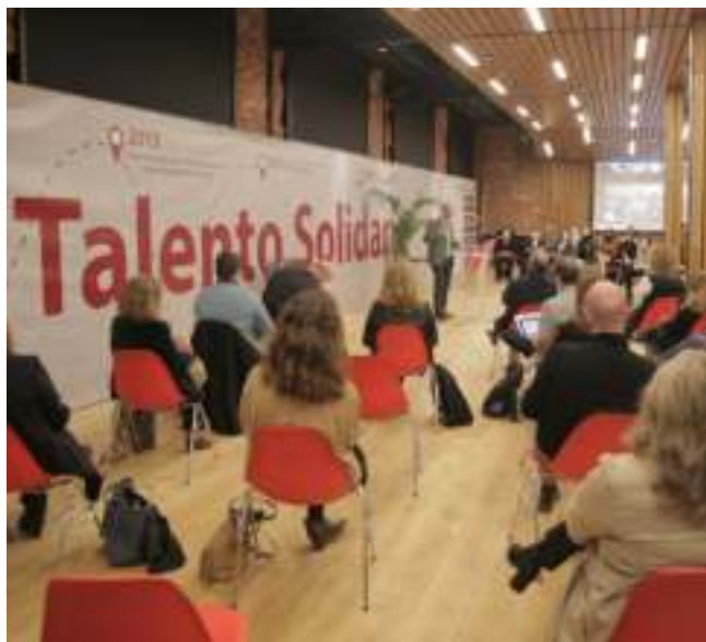
Opening ceremony of the 2022 Spirit of Solidarity Drive