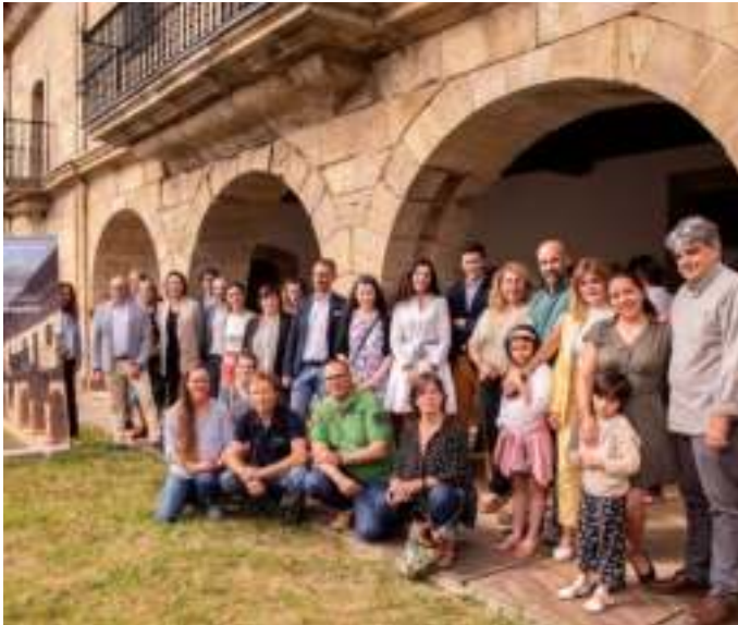
Entrepreneurs of the 7 th iteration of Nansaemprende during the closing ceremony at the Rectory House in Puente Pumar