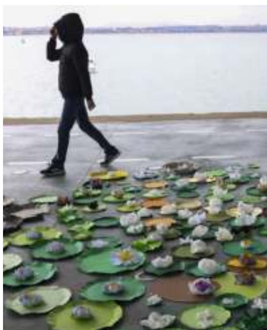
Participatory activity accompanying the exhibition Thomas Demand: Paper World