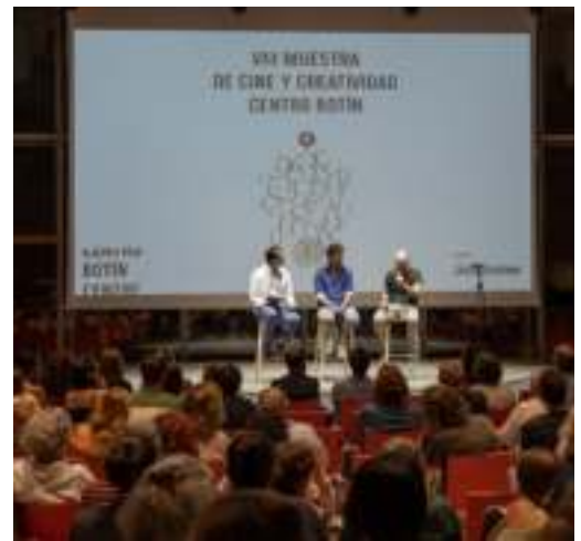
Colloquium of the 8 th Cinema and Creativity exhibition

thanks to the book recommendations that the Cantabrian libraries make after an inspiring visit to the exhibitions, 13 libraries having been involved with more than 150 books recommended.