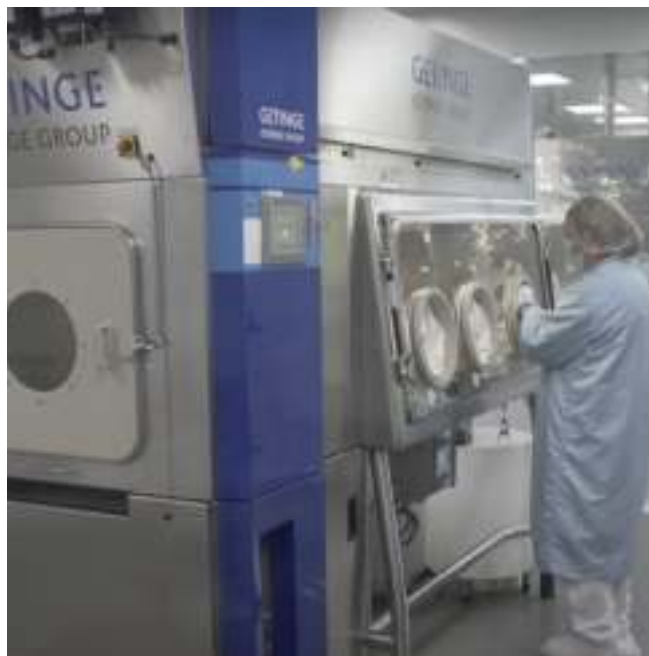
A Vaxdyn vial freeze foiler