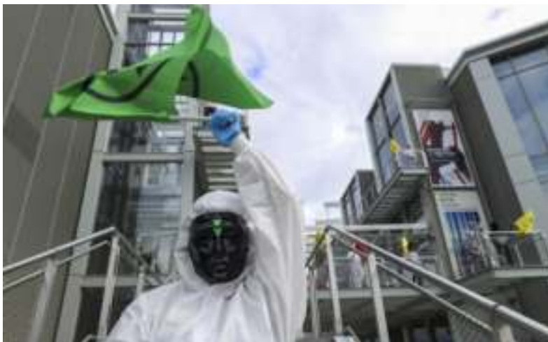
The immersive theatre show Overexposure