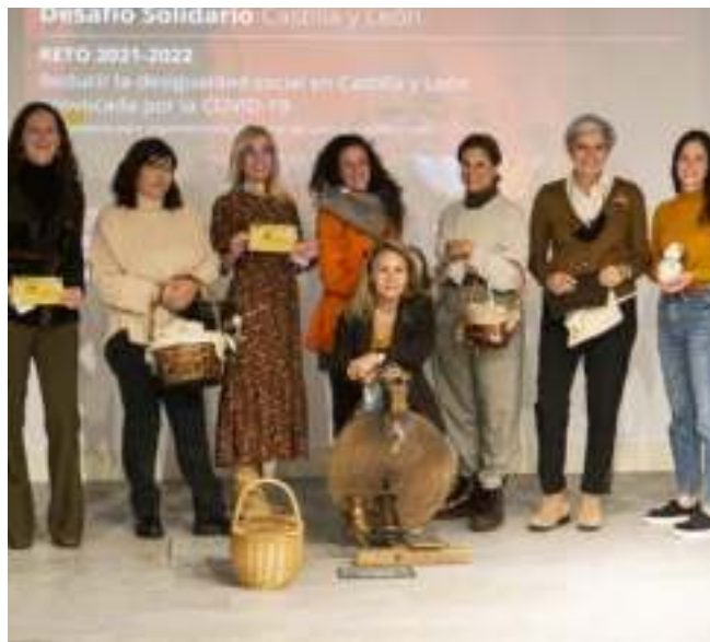
The Repopulators project of the Spirit of Solidarity Challenge