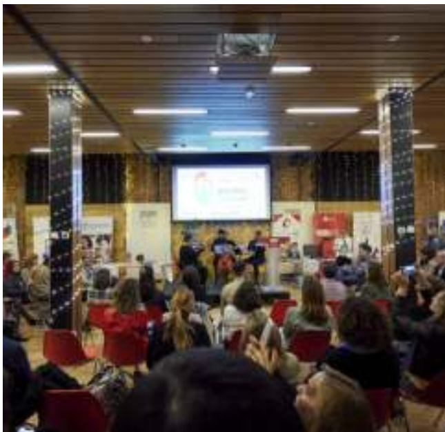
Christmas volunteering point. Spirit of Solidarity