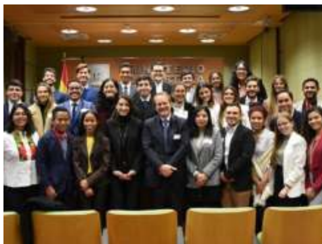
Visit to Spain's Ministry of Justice