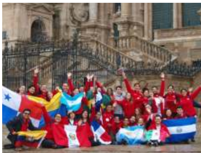
After three days walking the Way of St. James, the participants in the 13th iteration of the programme arrived at the Plaza del Obradoiro in Santiago de Compostela