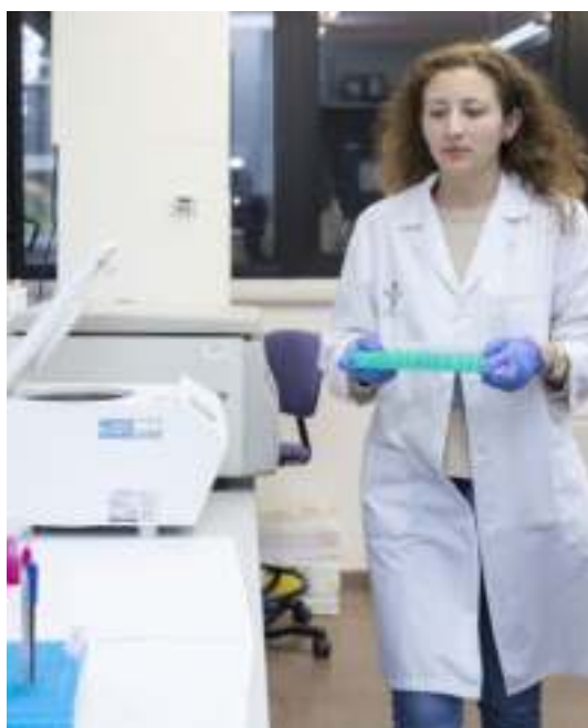
Laboratory equipment of the MiWendo Solutions firm