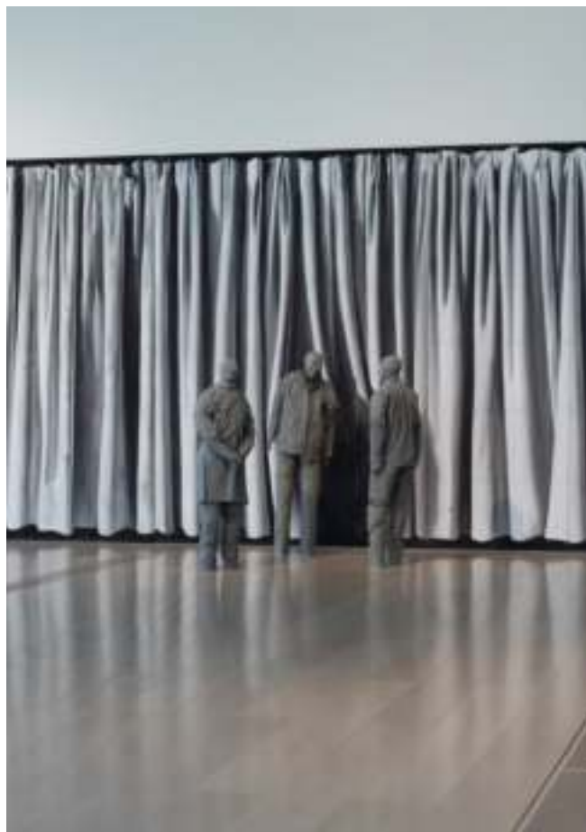
View of the exhibition Juan Muñoz. Drawings. 1982-2000