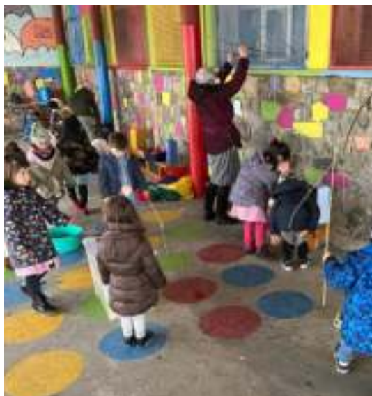
Interregional innovation programme. RE OBSERVE ACTION between Castilla y León and Murcia