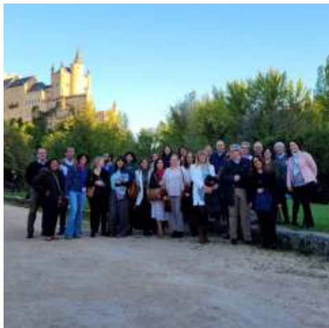
VII International Get.together of RE General Coordinators, Segovia

Accompanying and supporting the schools and colleges that make up the Network has been the great challenge in the last few years, which have been marked by the pandemic and its impacts. This has been the first year in which all the centres of the Network have got back to normal, with a return to in-person teaching and accompaniment on the school premises. In addition, progress has been made in the plan for innovation and updating of educational resources, especially the Tool Bench , with the aim of being able to deal with and address the whole range of situations and challenges facing the schools that make up the RE NETWORK, through emotional and social intelligence and creativity.