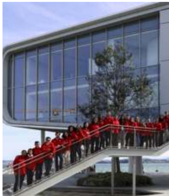
The training of the 13 th iteration of the programme continued at the Centro Botín in Santander, where the cohort visited the exhibition Damián Ortega: Expanded Vision