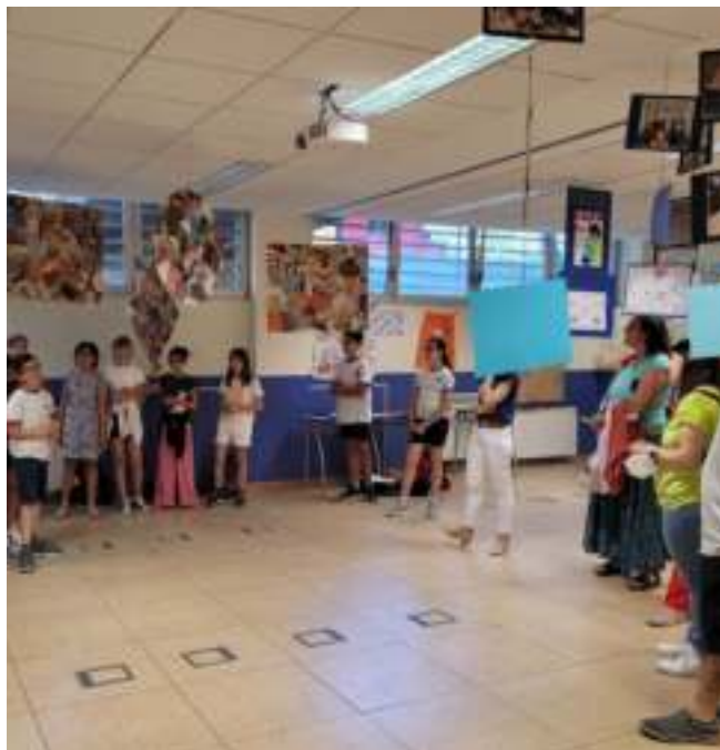
Responsible Education exhibition in El Porvenir school, Madrid. Work by students for the educational community