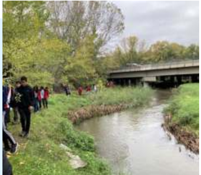
A guided walk with expert talks and artistic performances along the banks of the Manzanares River with alumni of the Strengthening the Civil Service in Latin America programme