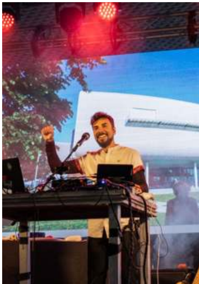
Concert by Ain TheMachine, on the occasion of the fifth anniversary of the Centro Botín