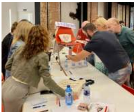
Initial training for new schools 2022/2023. Madrid