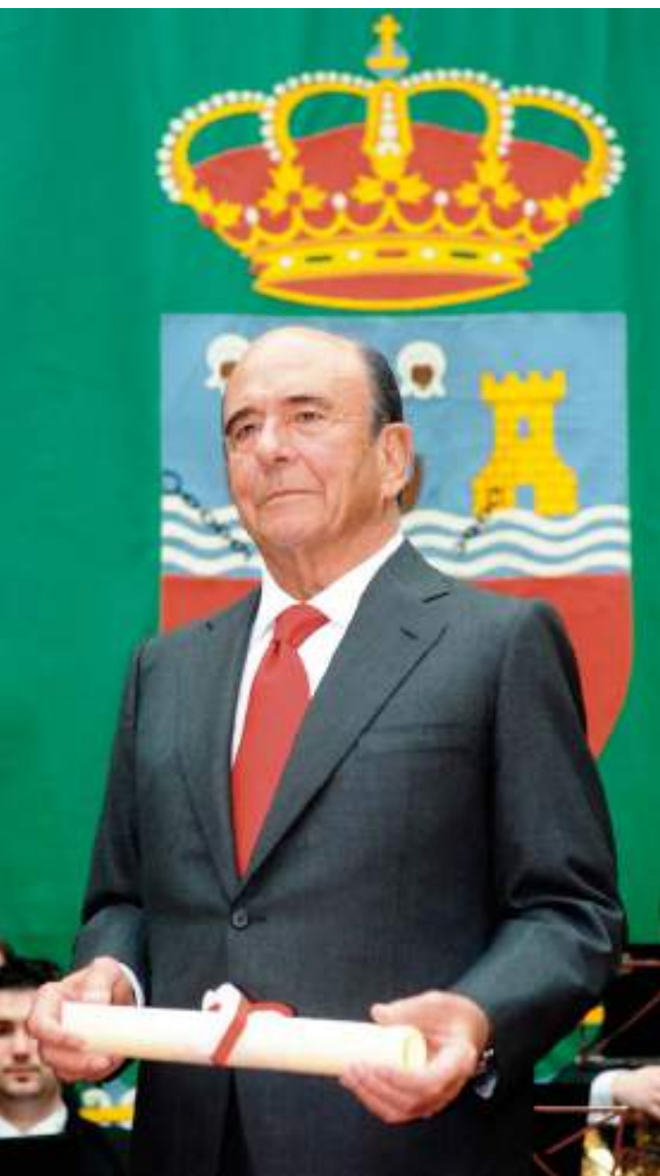
1/2/2011 Emilio Botín receiving the Gold Medal awarded by the Cantabria parliament to Fundación Botín.