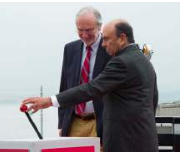
19/6/2012 Emilio Botín and Renzo Piano raise the enclosure around the former car park on the Albareda Wharf as a symbol of the start of construction work on the Botín Centre.