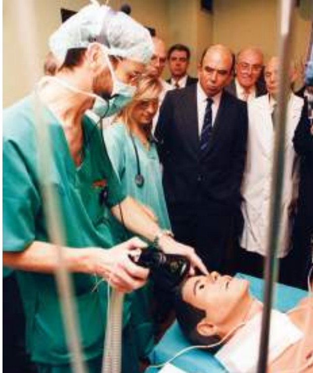
29/1/1998 Visit to the Centre for Simulation and Training in Critical Situations donated to Hospital Universitario Marqués de Valdecilla.