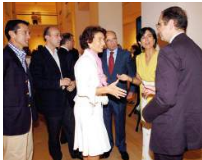
23/7/2004 Inauguration of the "La época de Picasso" exhibition. Miguel Ángel Cortés, Emilio Botín, Paloma O'Shea and Paloma Botín, among others.