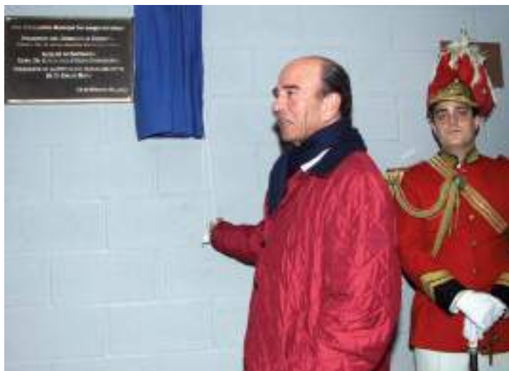
19/2/2003 Emilio Botín at the inauguration of the Marcelino Botín Municipal Sports Pavilion at Calle Tetuán, Santander.