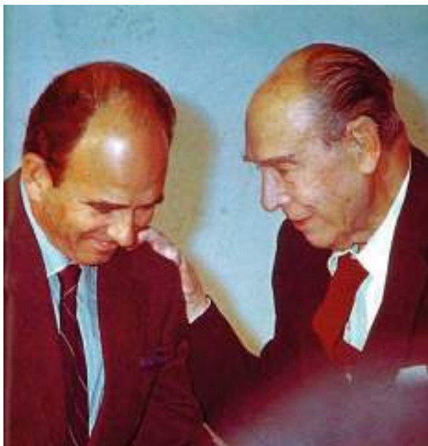
1987 Emilio Botín Sanz de Sautuola García de los Ríos with his father, Emilio Botín Sanz de Sautuola López