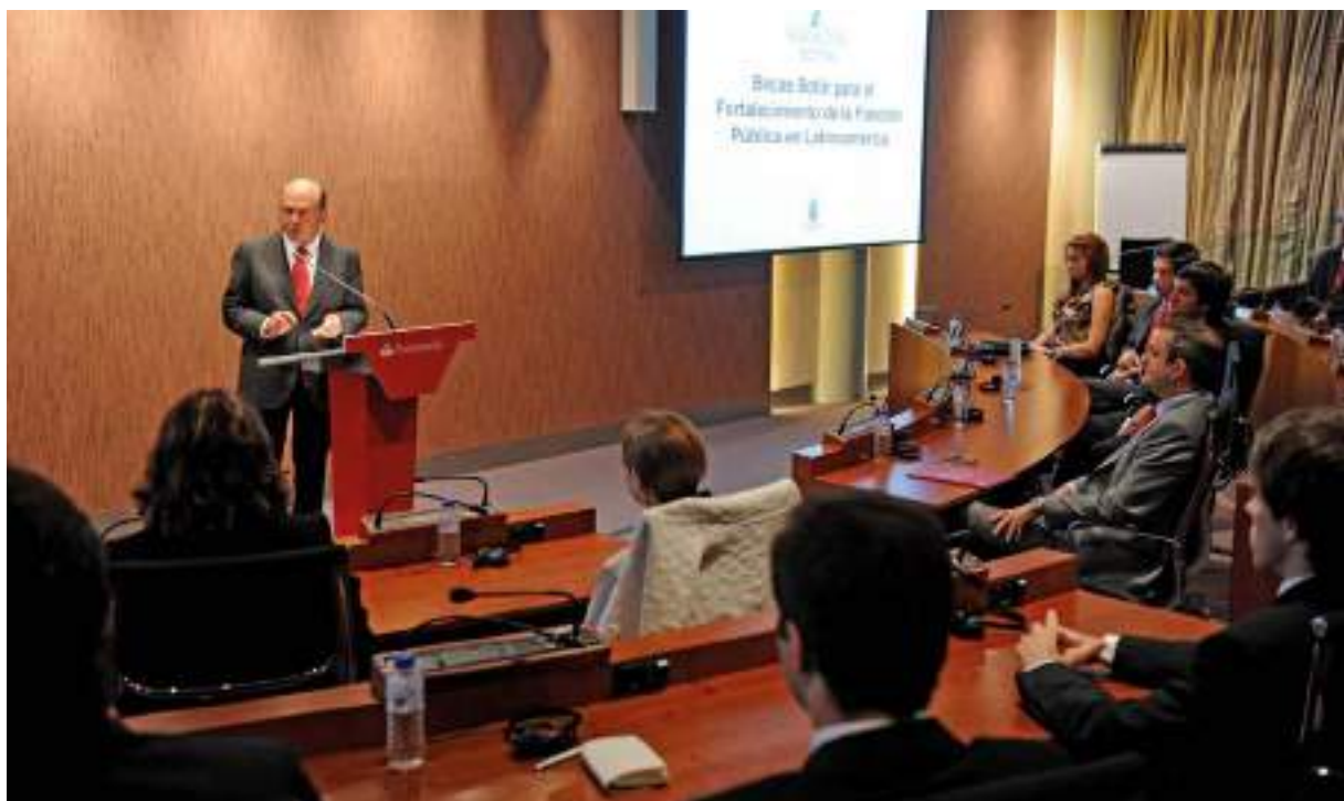
17/11/2010 Emilio Botín meets students from the 1st edition of the Programme for Strengthening the Civil Service in Latin America.