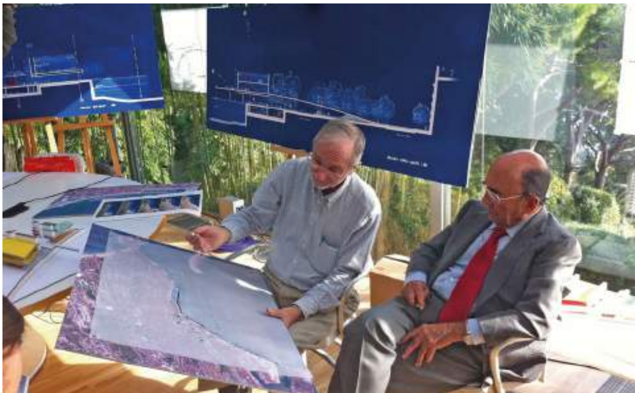
25/11/2010 Renzo Piano and Emilio Botín during the Chairman's first visit to the architect's studio in Genoa.

Major projects are not the result of an architect's work, but also, and above all, of the architect's creative dialogue with a person who has an idea, a vision.