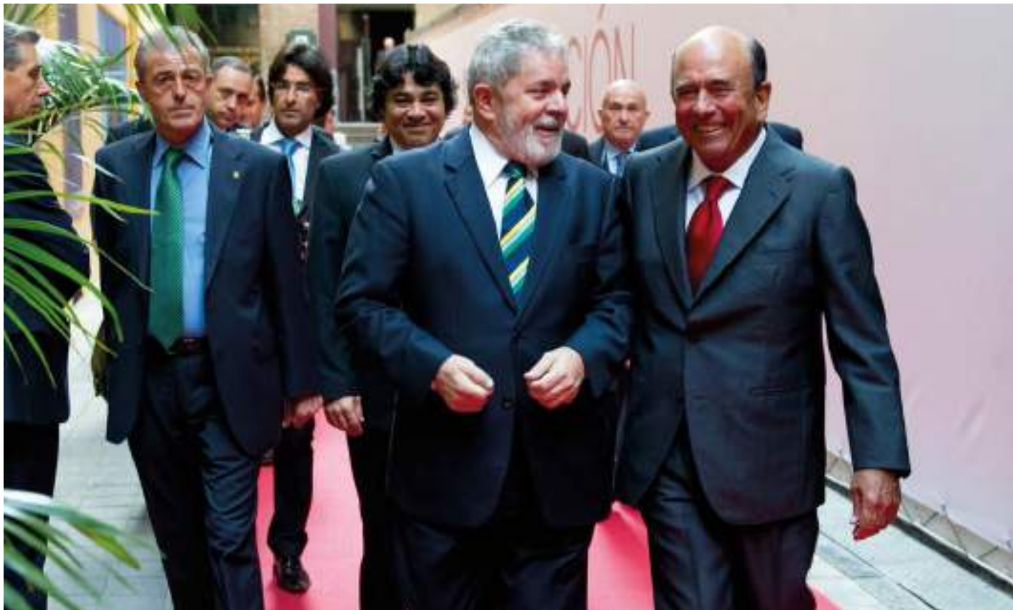
19/10/2011 Emilio Botín with former President of Brazil Luiz Inácio Lula da Silva, in what was Fundación Botín's first event at the new headquarters in Madrid.