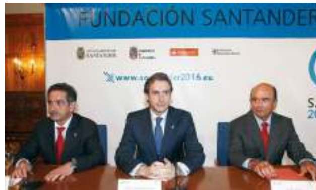
14/5/2009 Signing of the constitution of Fundación Santander 2016 with Miguel Ángel Revilla and Iñigo de la Serna.