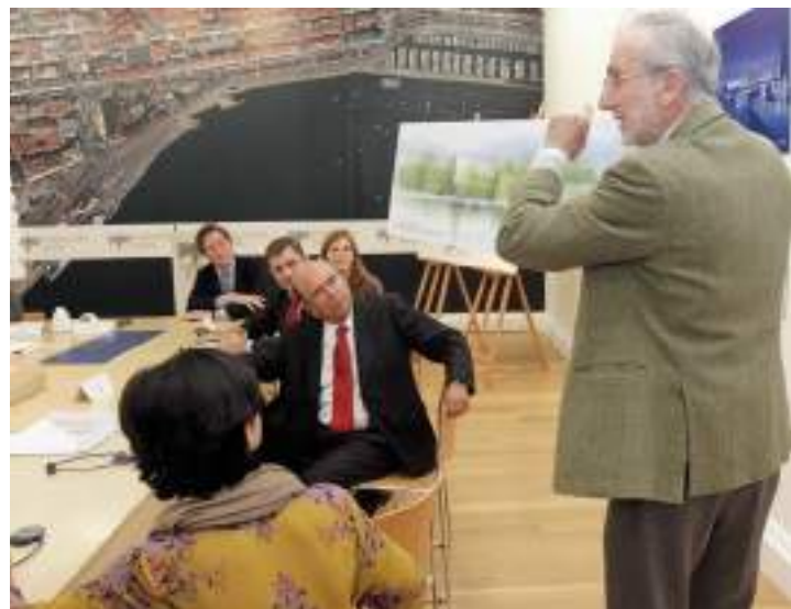
4/3/2012 Presentation of the Botín Centre project by Renzo Piano, at Fundación Botín headquarters in Santander.