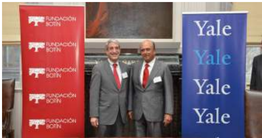
13/3/2013 Emilio Botín with the President of Yale University, Peter Salovey, at the signing of the agreement to develop creativity through the arts.

In 2002, at the proposal of Emilio Botín, Fundación Marcelino Botín decided to implement projects that tackled society's problems, seeking practical solutions. A number of topics were considered and initiated, all of which had considerable social relevance. One of these, of which Emilio was particularly fond and which excited him most, was aimed at improving children's education. The idea was to provide support to schools so as to improve the comprehensive education of pupils, making them more sure of themselves, increasing their sense of solidarity, making them more responsible and giving them a positive attitude to life alongside their academic training.