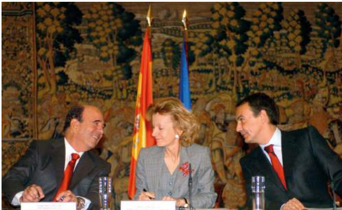
15/12/2005 Signing of the agreement with the Health Ministry for funding the National Cardiovascular Research Centre (CNIC). Pictured here with Elena Salgado and José Luis Rodríguez Zapatero.