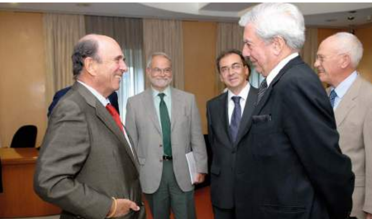
7/6/2006 Meeting of the Board of Trustees of the Miguel de Cervantes Virtual Library. Pictured here are the Chairman and Mario Vargas Llosa.