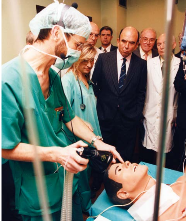
29/1/1998 Visit to the Centre for Simulation and Training in Critical Situations donated to Hospital Universitario Marqués de Valdecilla.