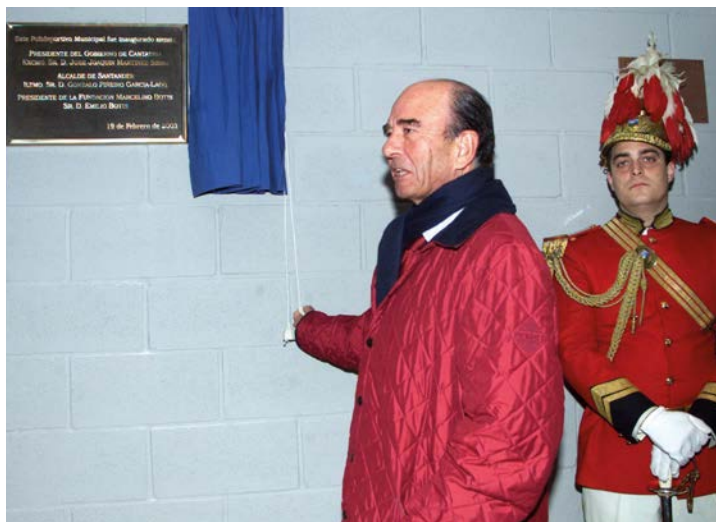
19/2/2003 Emilio Botín at the inauguration of the Marcelino Botín Municipal Sports Pavilion at Calle Tetuán, Santander.