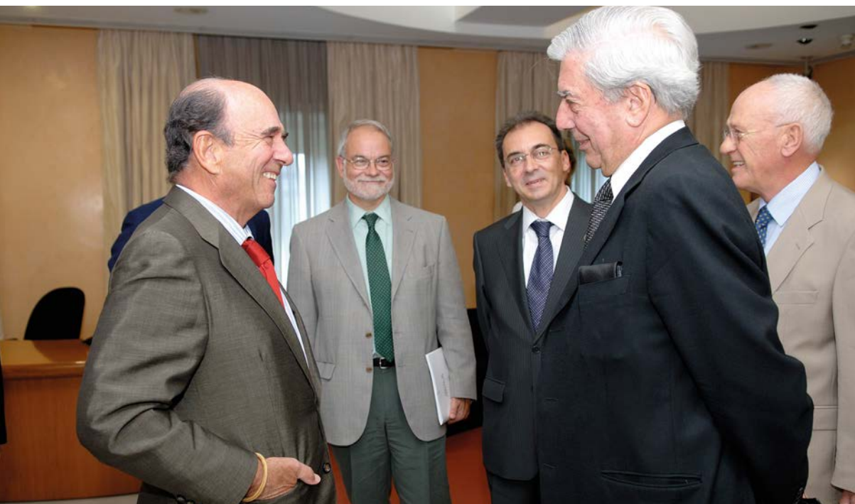
7/6/2006 Meeting of the Board of Trustees of the Miguel de Cervantes Virtual Library. Pictured here are the Chairman and Mario Vargas Llosa.