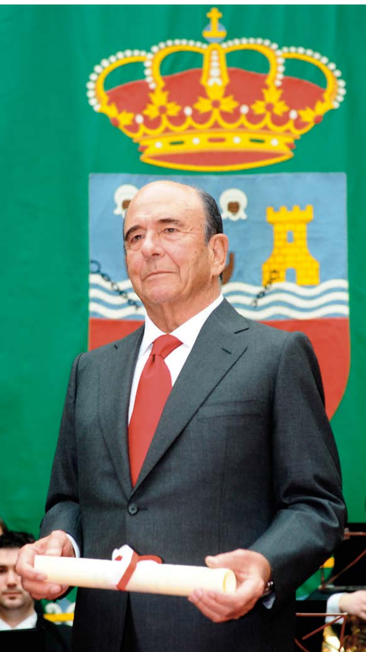
1/2/2011 Emilio Botín receiving the Gold Medal awarded by the Cantabria parliament to Fundación Botín.