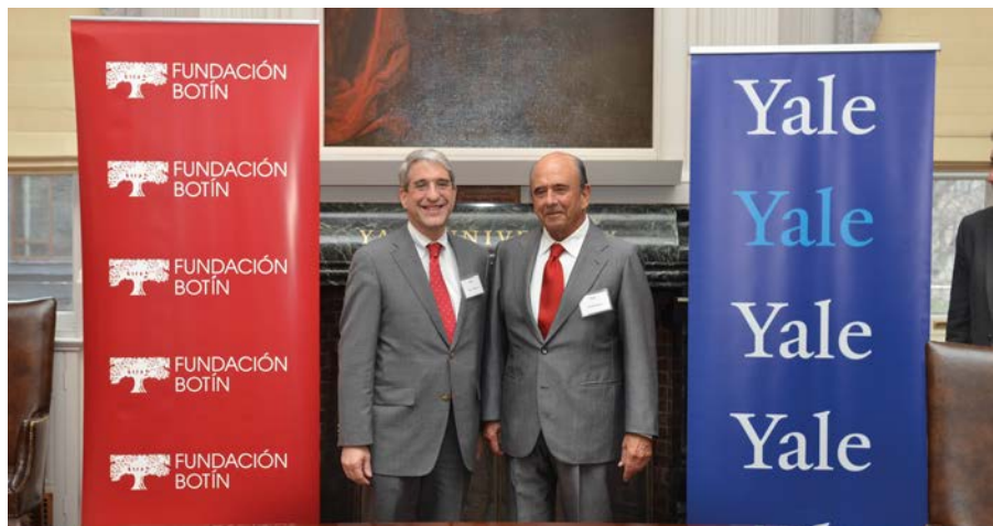
13/3/2013 Emilio Botín with the President of Yale University, Peter Salovey, at the signing of the agreement to develop creativity through the arts.

In 2002, at the proposal of Emilio Botín, Fundación Marcelino Botín decided to implement projects that tackled society's problems, seeking practical solutions. A number of topics were considered and initiated, all of which had considerable social relevance. One of these, of which Emilio was particularly fond and which excited him most, was aimed at improving children's education. The idea was to provide support to schools so as to improve the comprehensive education of pupils, making them more sure of themselves, increasing their sense of solidarity, making them more responsible and giving them a positive attitude to life alongside their academic training.