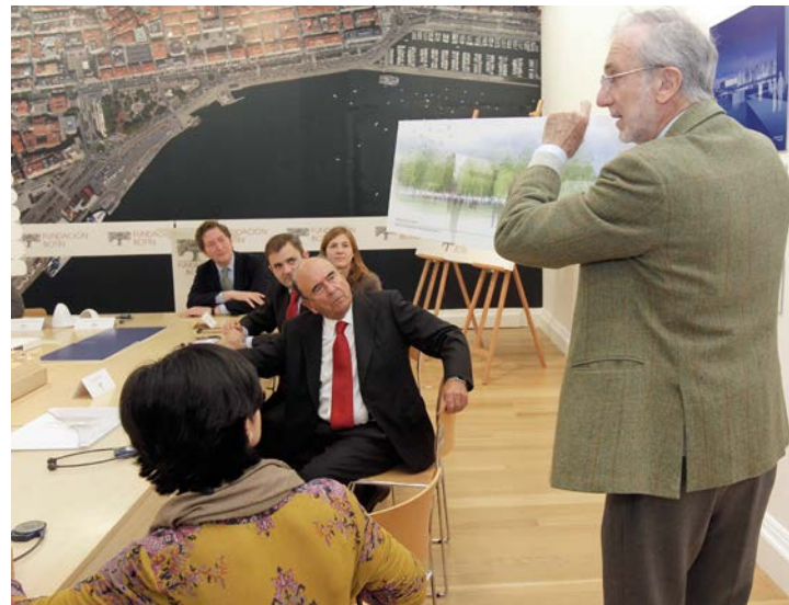
4/3/2012 Presentation of the Botín Centre project by Renzo Piano, at Fundación Botín headquarters in Santander.