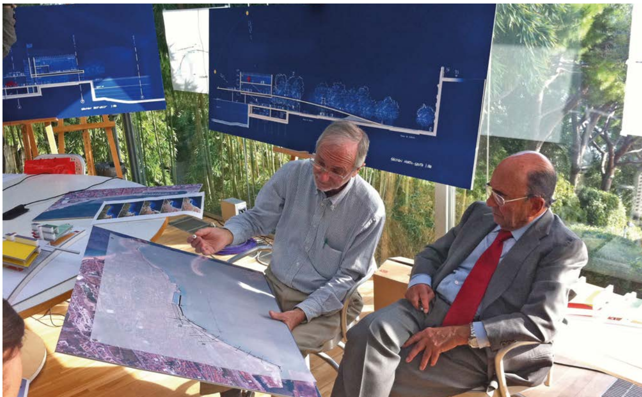
25/11/2010 Renzo Piano and Emilio Botín during the Chairman's first visit to the architect's studio in Genoa.

Major projects are not the result of an architect's work, but also, and above all, of the architect's creative dialogue with a person who has an idea, a vision.