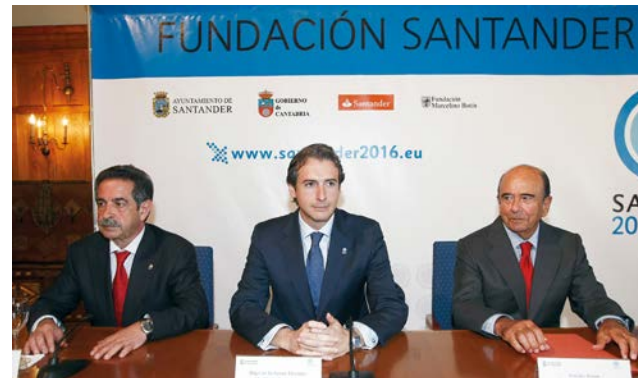
14/5/2009 Signing of the constitution of Fundación Santander 2016 with Miguel Ángel Revilla and Iñigo de la Serna.