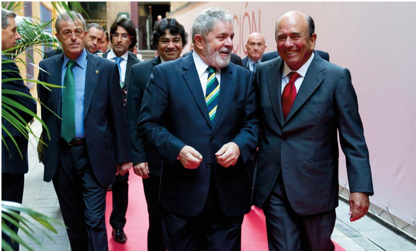
19/10/2011 Emilio Botín with former President of Brazil Luiz Inácio Lula da Silva, in what was Fundación Botín's first event at the new headquarters in Madrid.