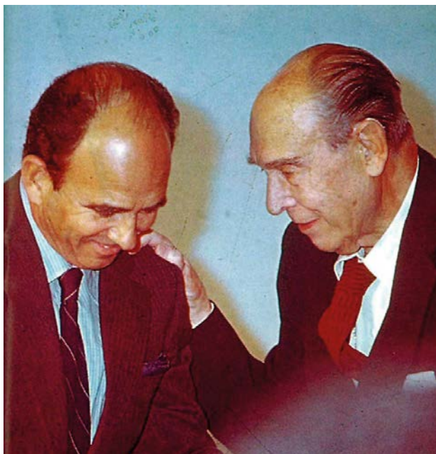
1987 Emilio Botín Sanz de Sautuola García de los Ríos with his father, Emilio Botín Sanz de Sautuola López