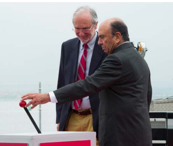
19/6/2012 Emilio Botín and Renzo Piano raise the enclosure around the former car park on the Albareda Wharf as a symbol of the start of construction work on the Botín Centre.