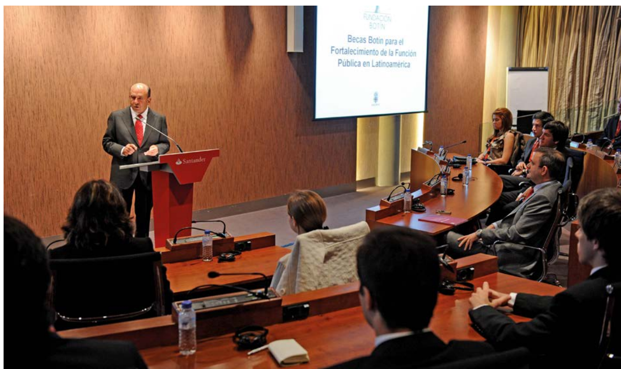
17/11/2010 Emilio Botín meets students from the 1st edition of the Programme for Strengthening the Civil Service in Latin America.