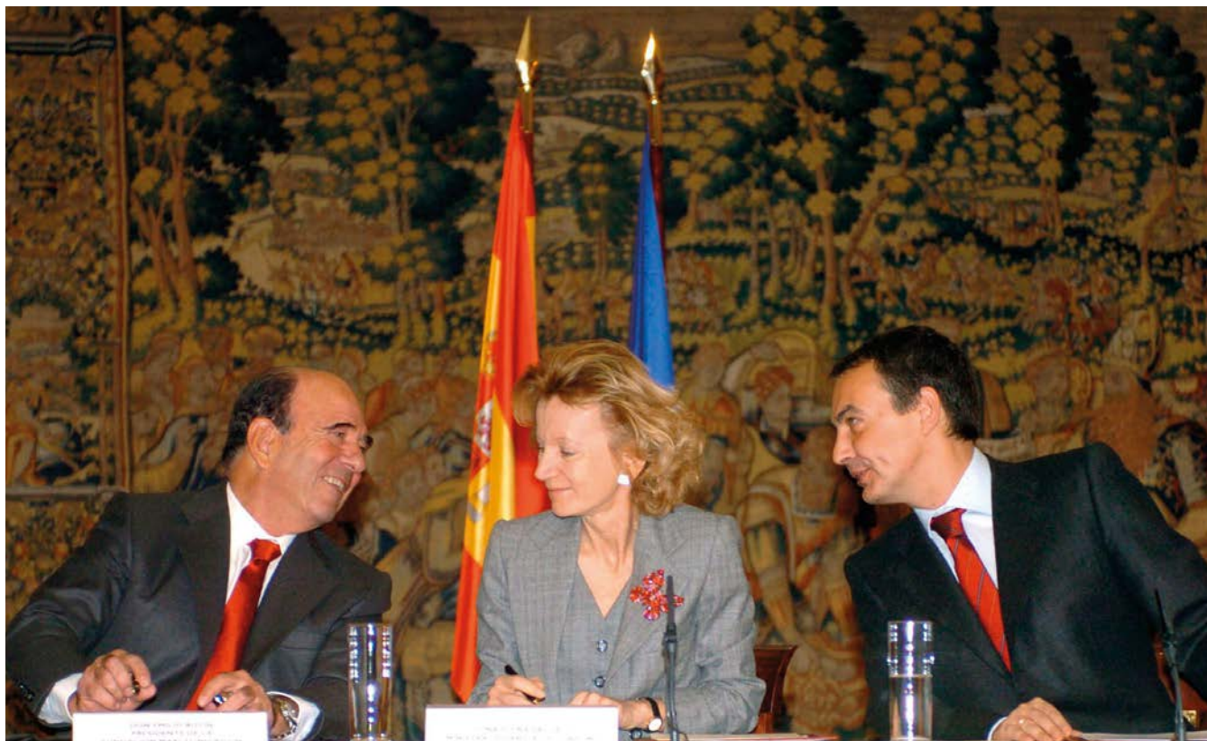
15/12/2005 Signing of the agreement with the Health Ministry for funding the National Cardiovascular Research Centre (CNIC). Pictured here with Elena Salgado and José Luis Rodríguez Zapatero.